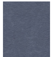
Squirrel Grey MMT12