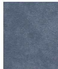
Slate Blue MMT13