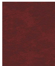
Burgundy Red MMT16