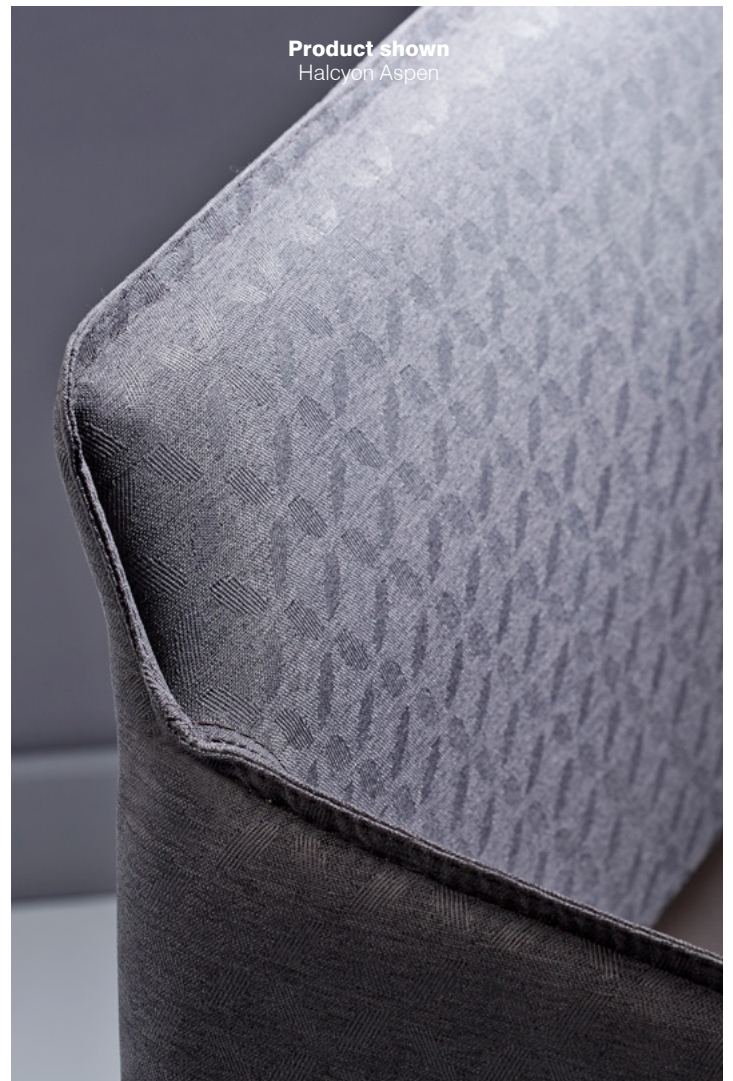
Product shown Halcyon Aspen

Available in two versions, Intervene Plain has a smooth surface finish, while Intervene Texture has a small-scale geometric grid. Both fabrics are woven from recycled post-consumer polyester and deliver the highest levels of performance and hygiene standards as a result of their stain repellent, waterproof, and antimicrobial TriOnyx™ backcoat which is applied as standard.