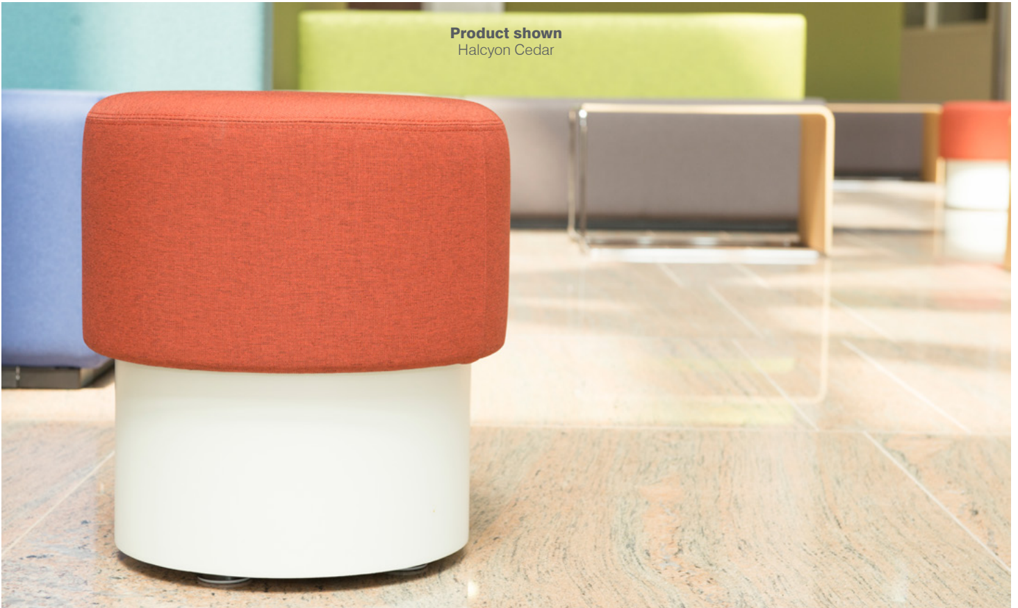
Product shown Halcyon Cedar