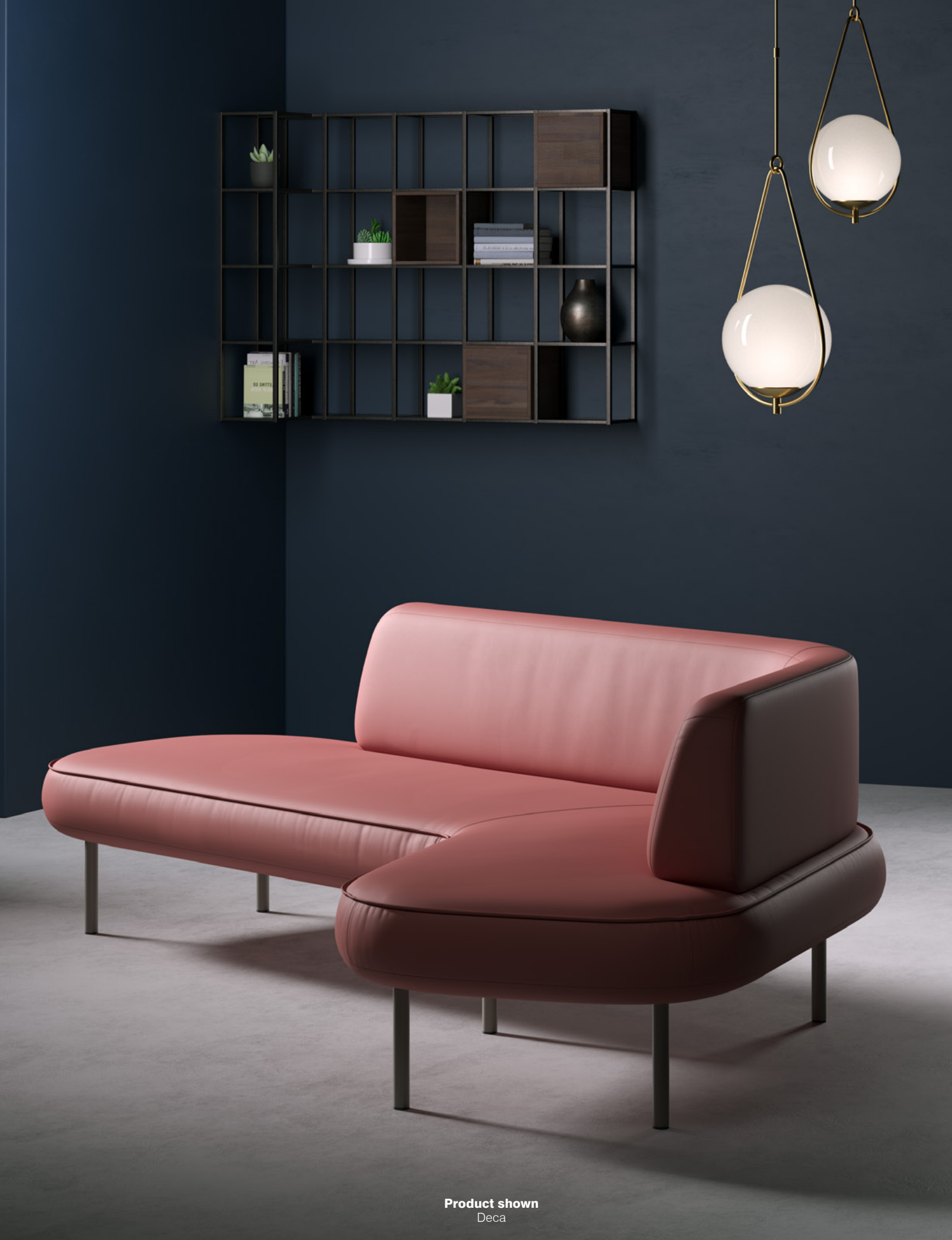
Product shown Deca