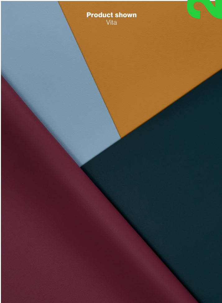
Product shown Vita

With a subtle surface grain effect and full matt appearance, Vita is a striking leather-look vinyl. Available in a dynamic palette of lights, brights, and mid-tone hues, the colour selection was carefully curated to complement a range of hospitality interiors.