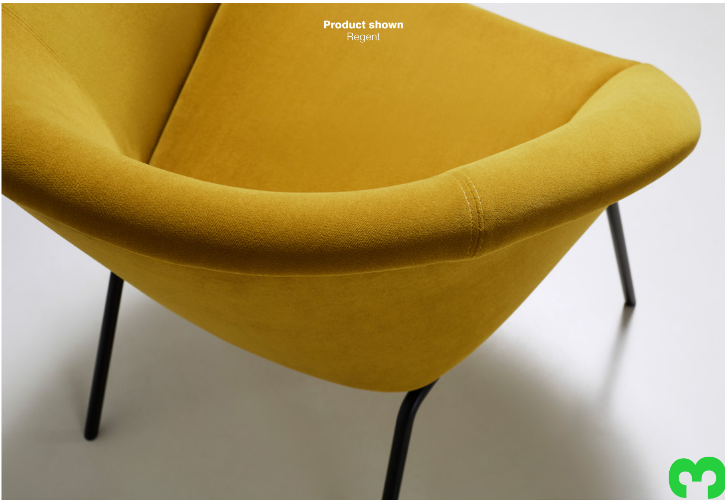
Product shown Regent