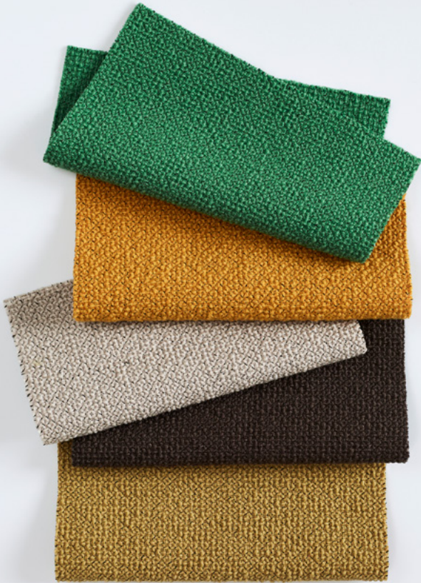
Product shown Yoredale