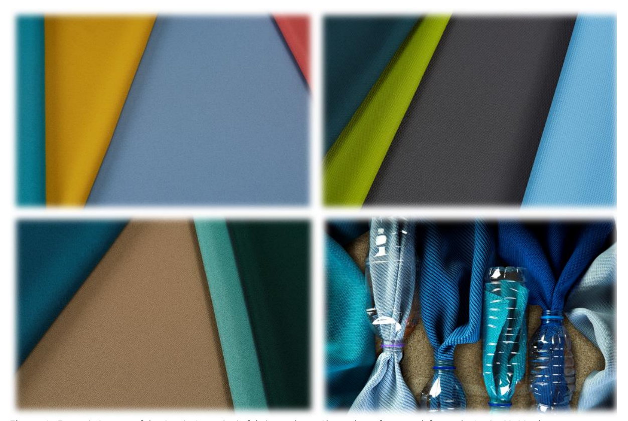
Figure 1. Example images of the Camira's synthetic fabric products. Shown here, from top left, are the Lucia CS, Manhattan, Oceanic, and Lucia products.